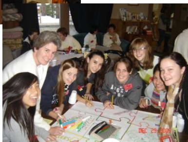
Group activities & faith-oriented discussions