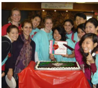
For young women in their sophomore year in high school through college

Arrival time 4:00 p.m. Retreat begins with dinner at 5:00 p.m. on February 18 and concludes at 2:00 p.m. on February 20