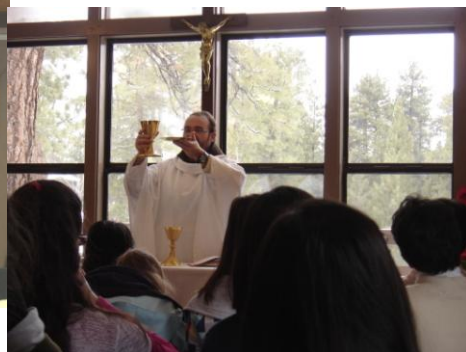
Eucharistic Liturgies & Sacrament of Reconciliation